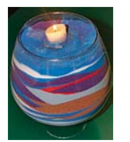
The grains of sand in this candle represent the prayers of each student.

"I commit myself in 2007 to be the best person God wants me to be. I will show respect for myself, my family, my school, and all people of the world."