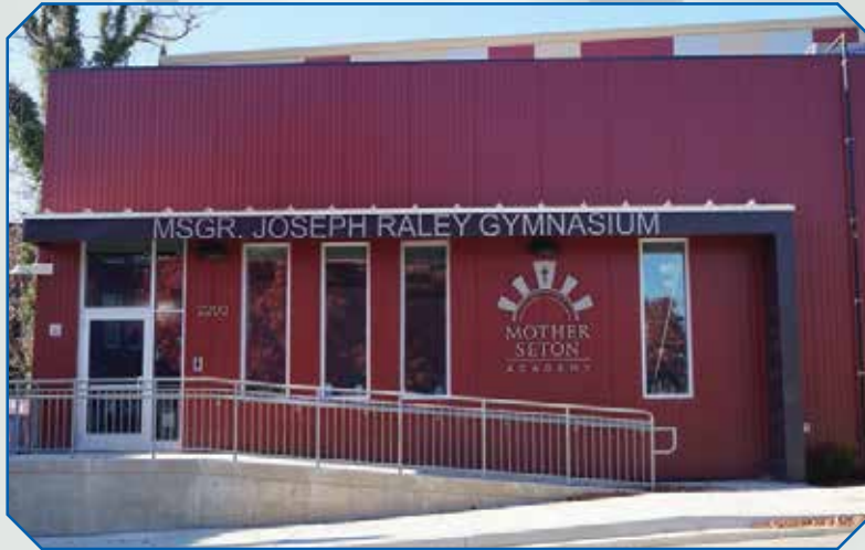
2200 Boone Street - November 2019