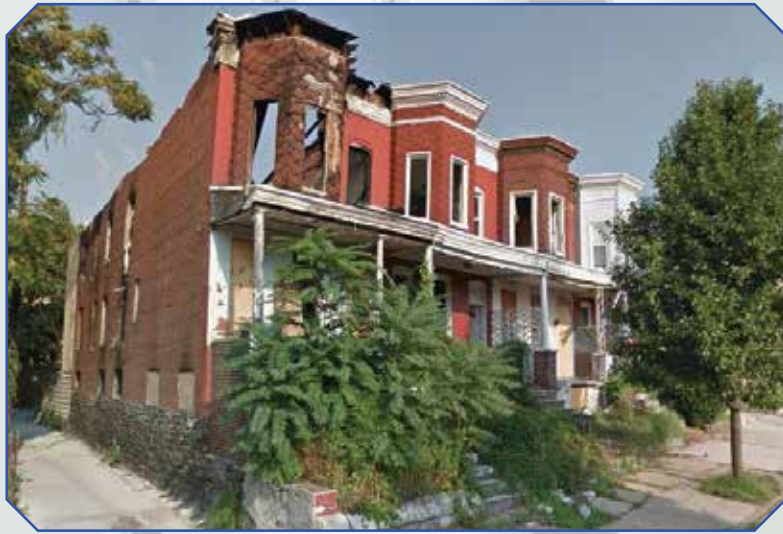
2200 Boone Street - August 2011