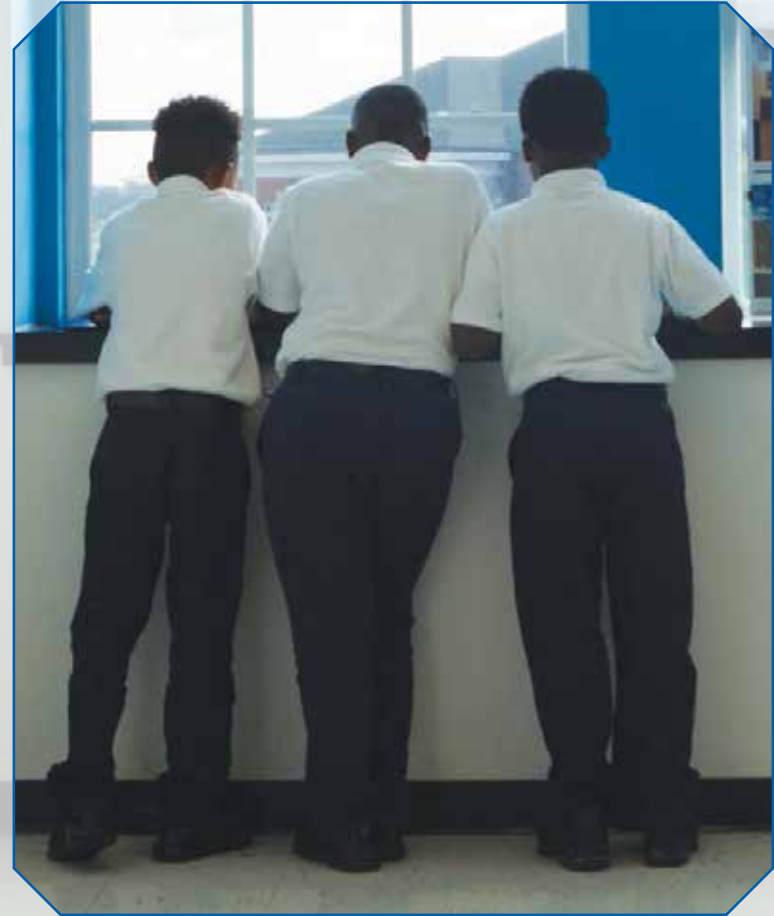
6 th -grade boys watching construction of the new expansion.